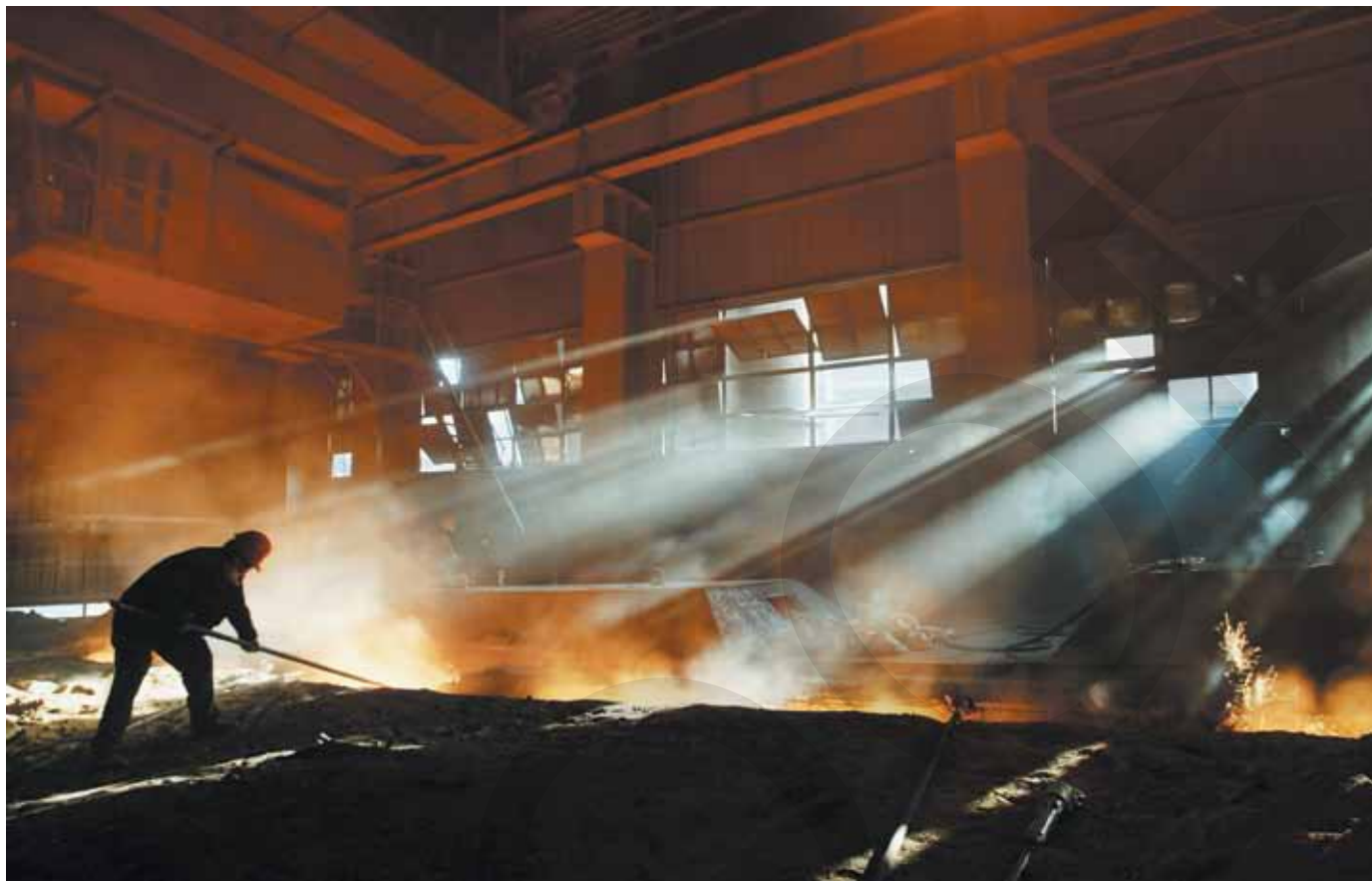
Steel mills and other heavy industries amplify carbon emissions in Inner Mongolia, while the products are consumed in more affluent parts of China.